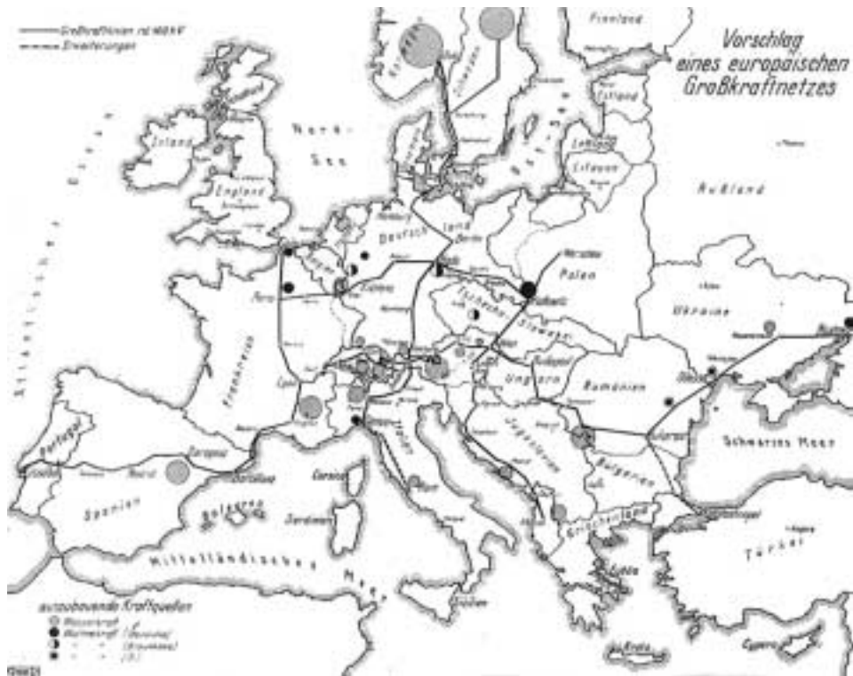
Figure 2 Oskar Oliven’s plan for a pan-European electric power grid was one of several schemes for electrical integration published around 1930. Oliven saw a major role for the abundant hydropower resources of Scandinavia. Norwegians, however, were reluctant to export their electric power. After the Second World War, similar visions of electrical integration were developed based on the promises of atomic power.

One irony is that such plans fell far short of being executed. Another is that this way of thinking was picked up in Nazi Germany. Helmut Maier shows how new scientific domains as large-area economy— Grossraumwirtschaft —and large-territory technology— Grossraumtechnik —ideologically connected transnational infrastructure building to the building of a New Europe, Neuropa . 66 During the Second World War, several transborder power, highway, and broad-gauge railway systems were built. Yet rather than forging a new society or Reich, they served to extract energy and raw materials from the annexed countries destined for the German war economy. Moreover, analysing the industrial complex of Auschwitz, Maier shows that the war industry was